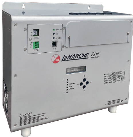
Unit Shown: RHF2-20-12V-U1

The La Marche RHF2 series uses proven High Frequency charging technology and is developed specifically for the railroad market. It is typically used for signaling, highway crossings and motion detection systems where the battery is cycled frequently.